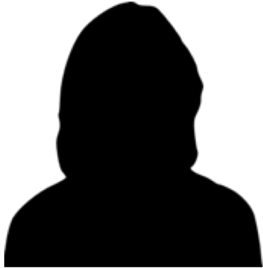
Flora B2 China

There's a mistake, because 'his husband'? Look.